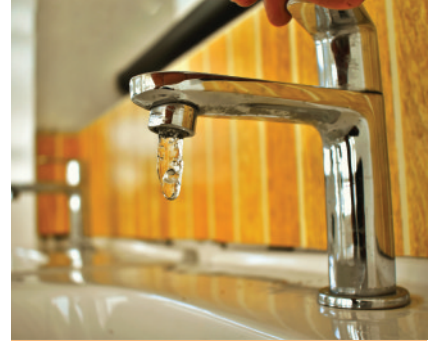
Manjeera Water Provision