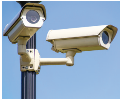
4X6 CCTV Surveillance