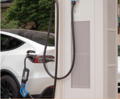
EV Charging Point